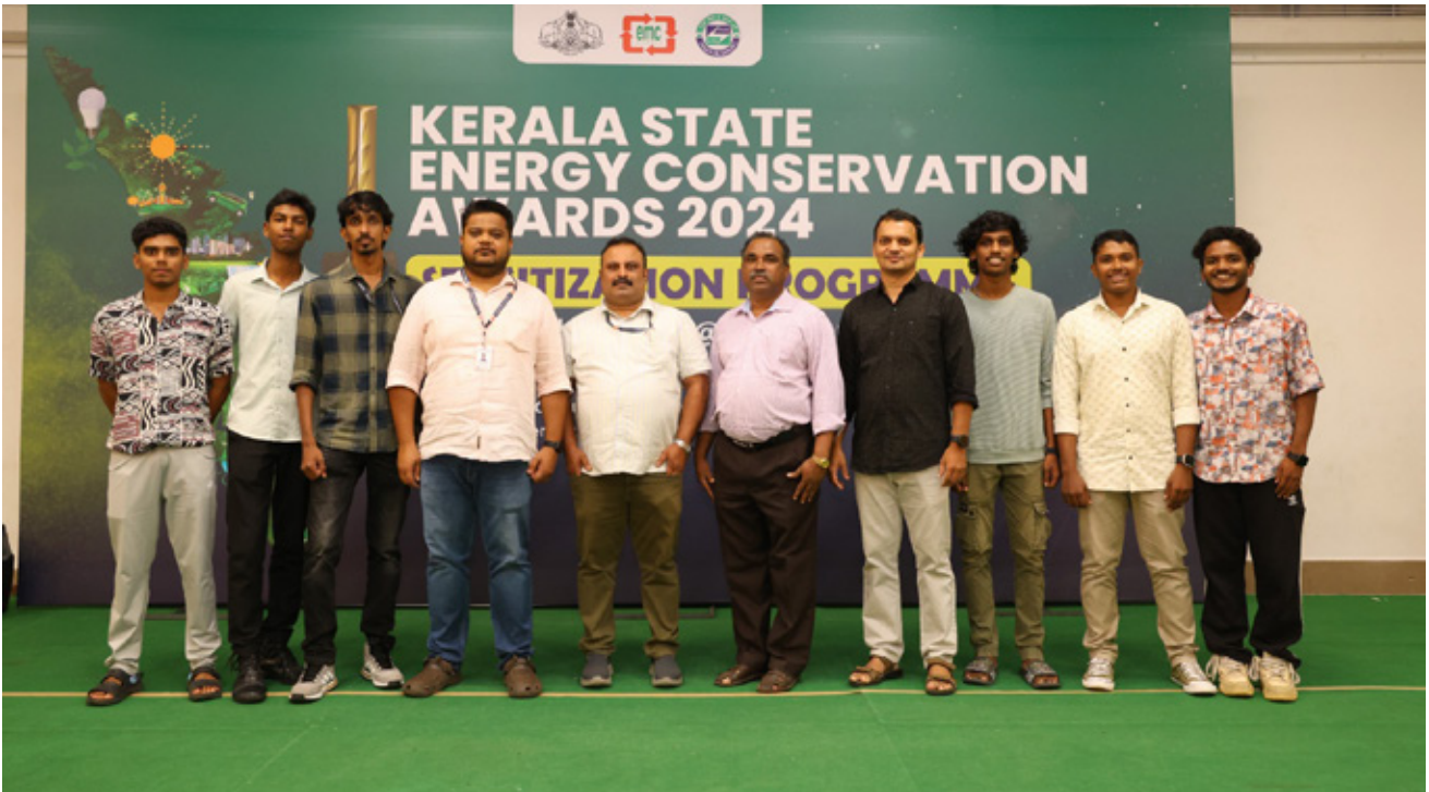
Programme volunteers with EMC Officials