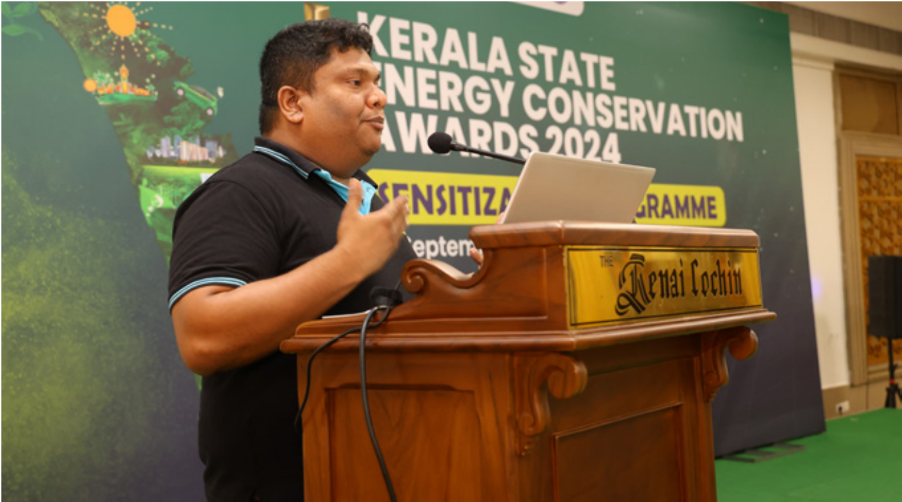
Technical presentation of Alpha Geek