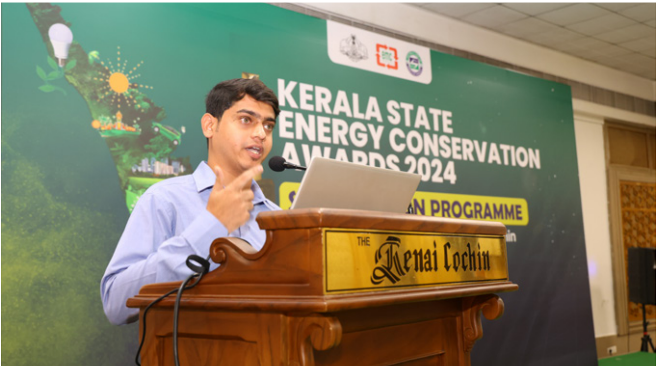
Technical presentation of Nippon Paints