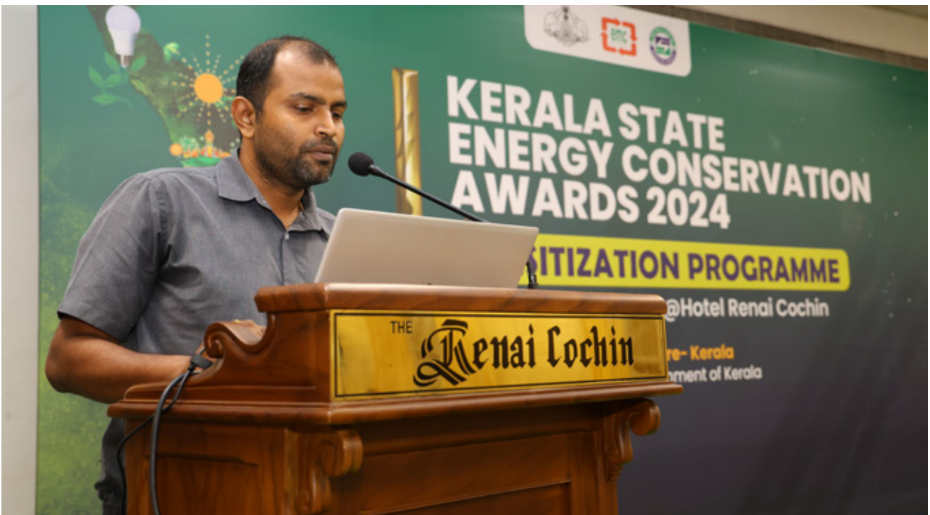
Technical presentation of Apollo Tyres Kalamassery