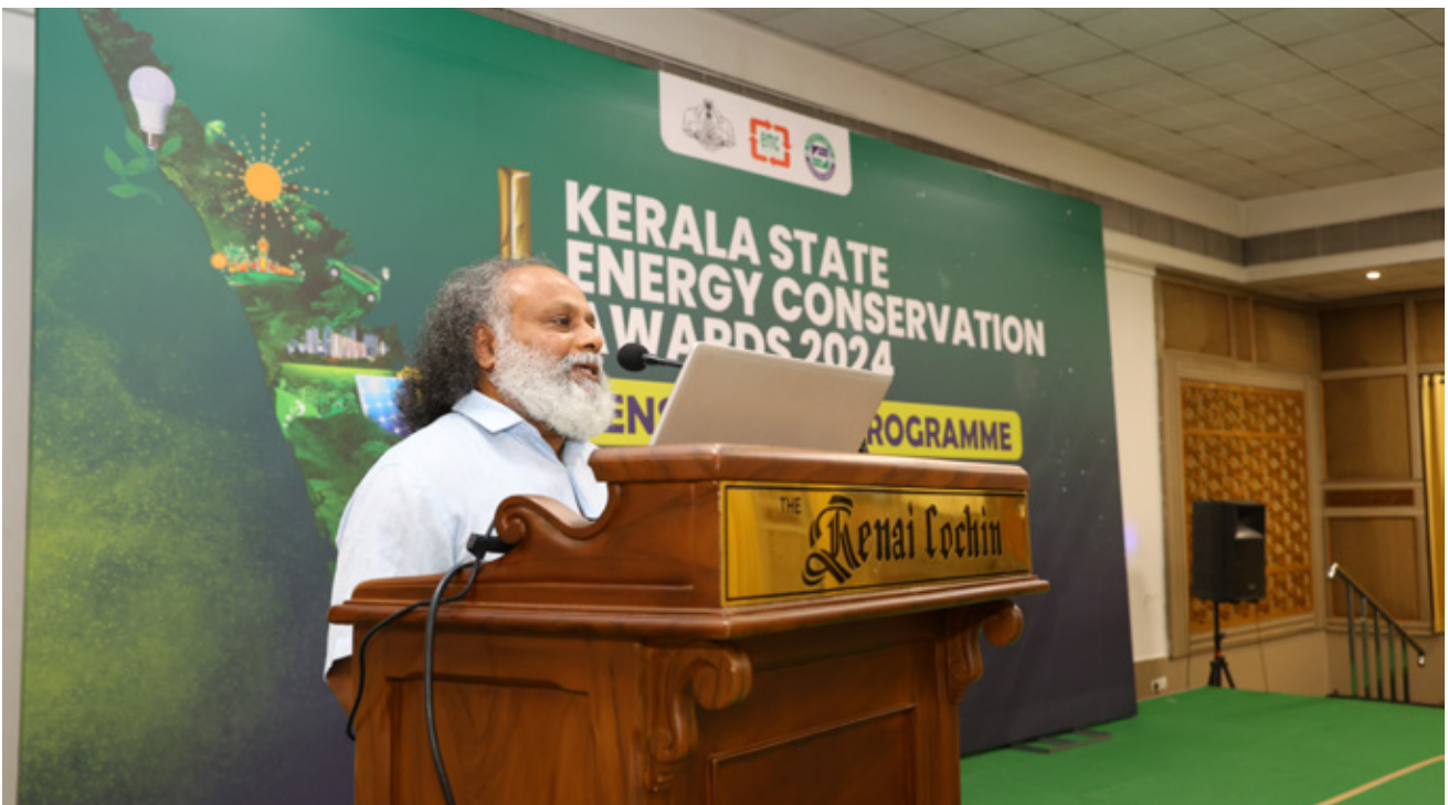
Technical presentation of Tranquility