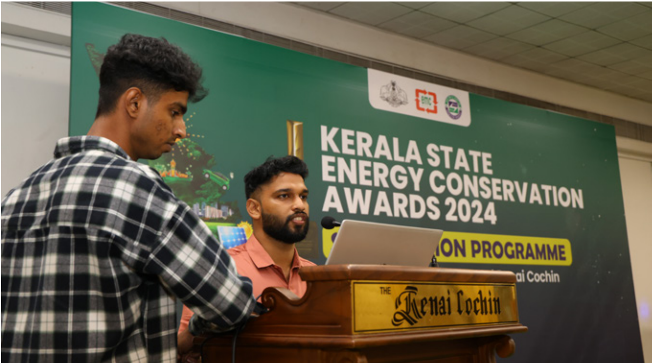
Presentation of filling up of application demo by JitTec