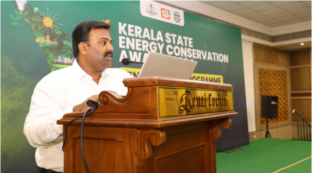
Technical presentation of Excel Coatings