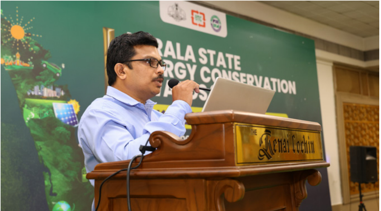
Technical presentation of Hykon India Ltd