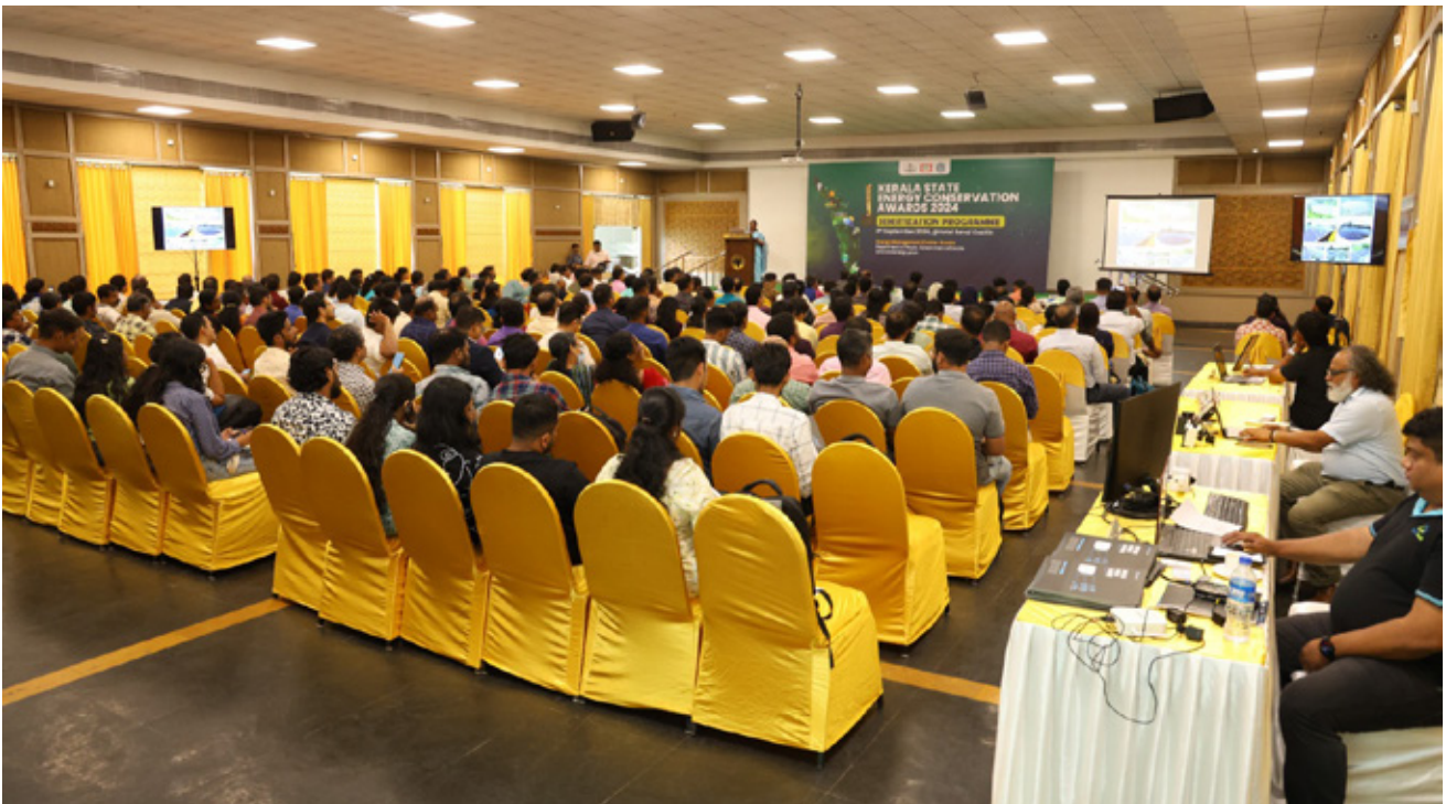
Gazebo Hall at Hotel Renai Cochin