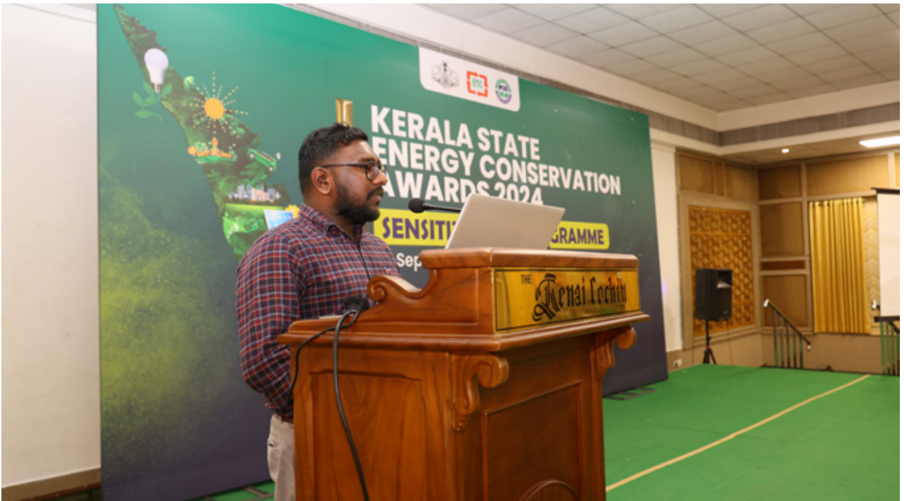
Technical presentation of V-Guard Industries