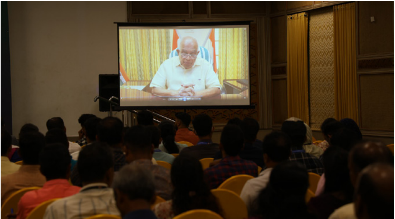
Hon'ble Electricity Minister of Kerala Shri. K. Krishnankutty inaugurating the Sensitization Programme (Through video message)