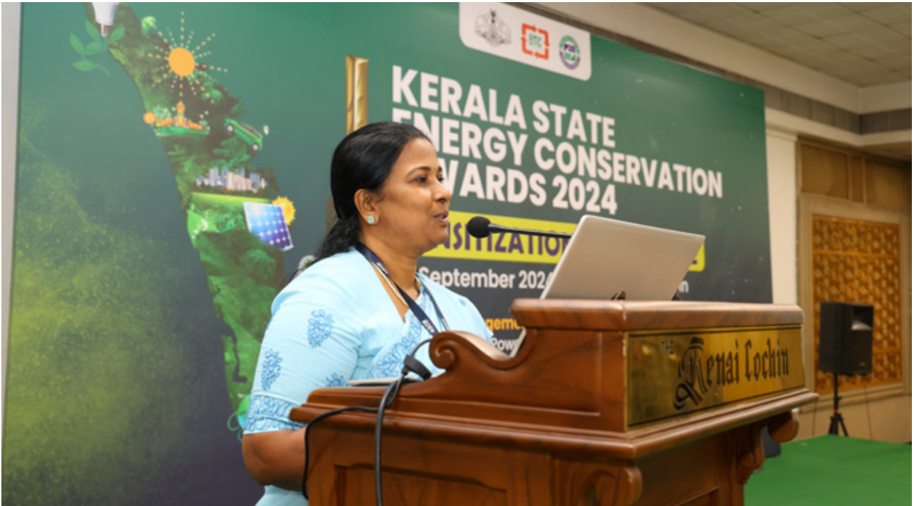
Technical presentation of KSEB