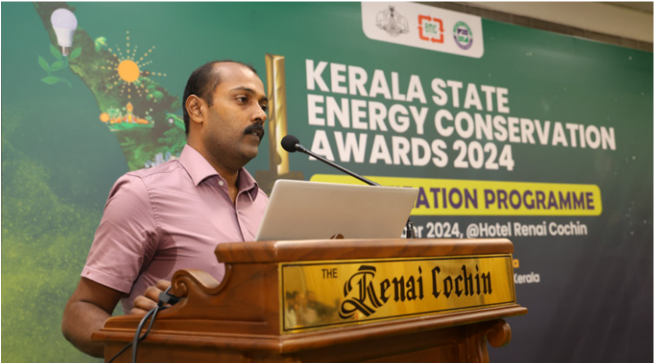
Technical presentation of HLL LifeCare Akkulam Factory